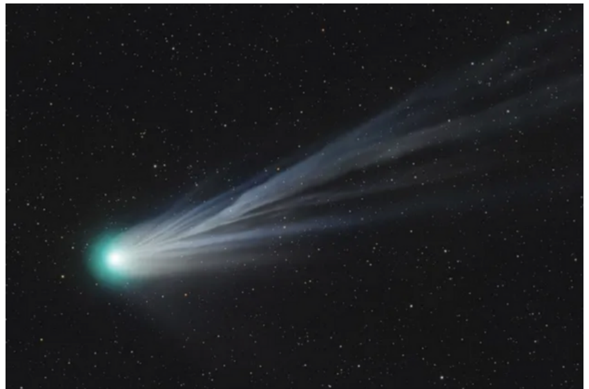
Comet Pons-Brooks, as it appeared in early March 2024 from Skull Valley, Utah.

It should be noted that this photograph was taken with the benefit of a telescope, excellent photographic equipment, and the ability to synchronize the exposure with the rotation of the earth. Trying this at home will yield mixed results.